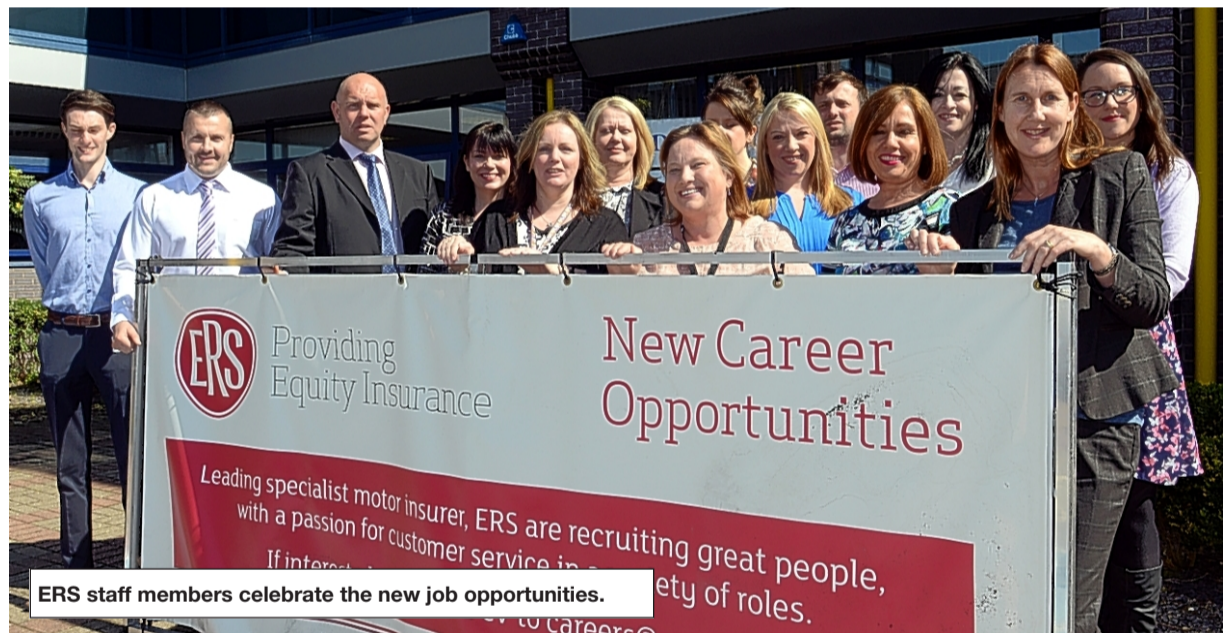
ERS staff members celebrate the new job opportunities.